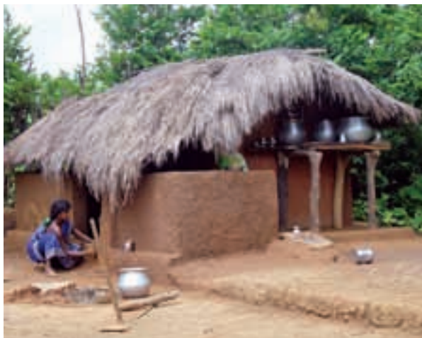
Programmes focus on the socially excluded tribal groups